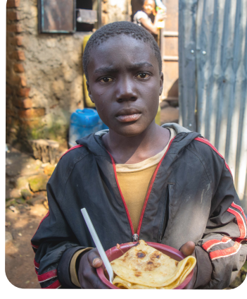
New to the streets? Trauma and confusion