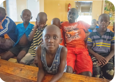
The Children at home, yet at school. These are blessings to us all and they are Kenya's future!

Bungoma Bible Ministries has a mandate from our Lord Jesus Christ, that we are to care for orphans. This means that despite the concerns of the virus and supply, we will continue to feed and clothe these boys who have been abandoned to the streets.