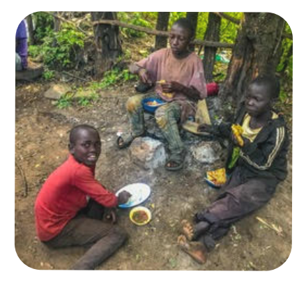
Feeding the Street Kids

We are so proud of our older boys, that have returned from University, stepping up to help provide the food needed. They are learning valuable lessons in servanthood.