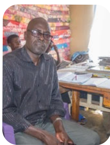
The Boys Tutor

Now that we have all the boys home at the same time we do not have enough mattresses. We have arranged it so a few of our younger and smaller boys share their beds to make it work. However we are in need of 2 beds for our boys.