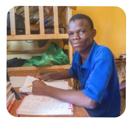
One of our Boys Studying