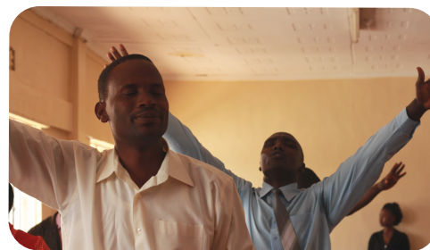
Worship Service in Bungoma Bible School