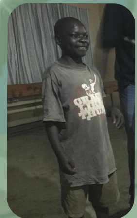
Our new boy in the Children's home