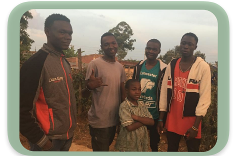
High School Boys from the Children's home