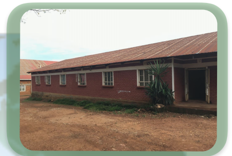
Men's Dormitory at Bungoma Bible School