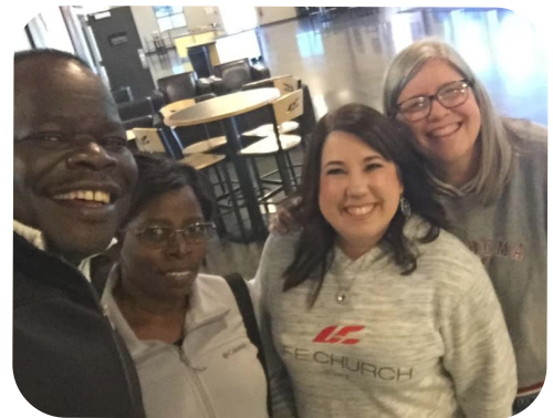
Communion with our Family in Tulsa, Oklahoma

The word 'fellowship' here in greek is the same word grouping we use when we say communion. Communion is the fellowship we share when we come together to hear the Word of our Lord Jesus Christ, when we break bread together and enjoy a meal to commune, and communicate the goodness of our God.