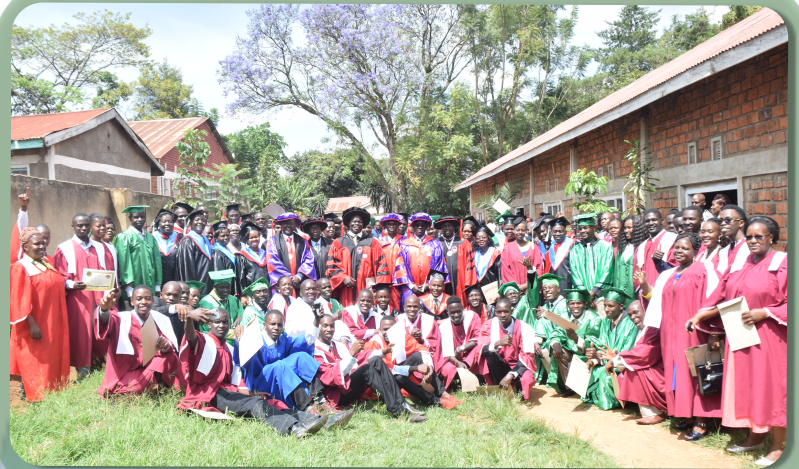
2018 Graduation Class of Bungoma Bible School, 96 graduates