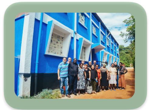
Newly painted Bungoma Bible School