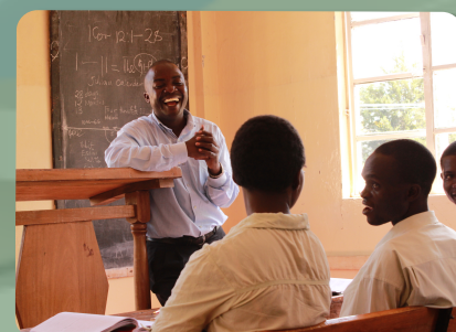
A class at Bungoma Bible School

Bungoma Bible Ministries ♦ PO BOX 25489 ♦ Colorado Springs ♦ Colorado ♦ 80936