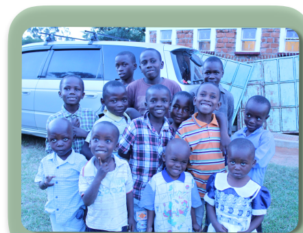
Children from Bungoma Children's home

We currently have four of our young men attending Bungoma Bible School. These students, whose testimonies you have heard in the January Newsletter are here to be discipled as well as learn how to disciple, change their communities, cities, villages, and even nations. They are growing in wisdom and truth through the sound biblical teachings from the Word of Our Lord Jesus Christ. They are being transformed by the Word so that they can then go on to transform the lives of nations and generations.