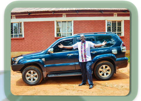
New Ministry Vehicle