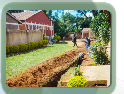
New Septic Tank for the property

Bungoma Bible Ministries ♦ PO BOX 25489 ♦ Colorado Springs ♦ Colorado ♦ 80936 www.bungomabibleministries.org ♦ info@bungomabibleministries.org