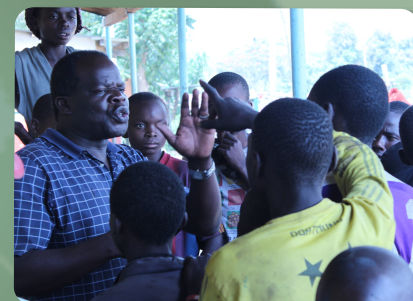
A few of the Street Kids we cloth, feed and minister to