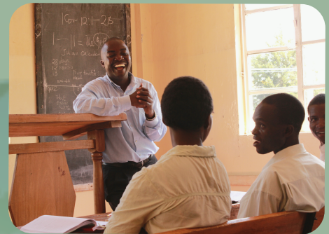
Teaching at Bungoma Bible School