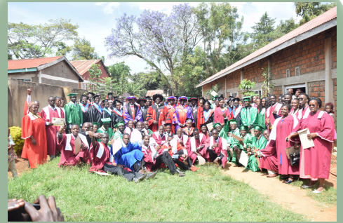
Bungoma Bible School Graduates