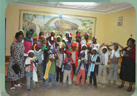
Some of our kids in the Children's Home

Bungoma Bible Ministries ♦ PO BOX 25489 ♦ Colorado Springs ♦ Colorado ♦ 80936