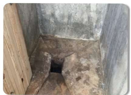
Bungoma Bible School Toilets