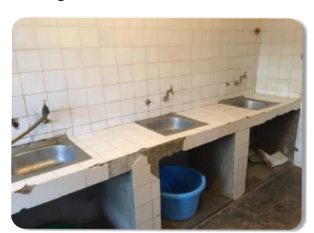
Bathrooms - in need of repair