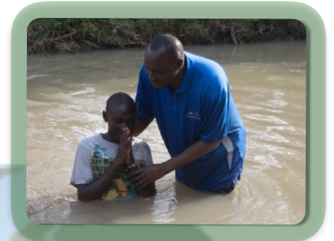
Baptism in the River