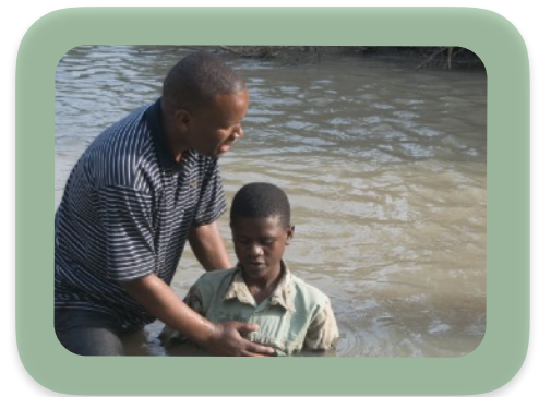
Baptism in the River