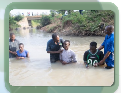
Baptism in the River