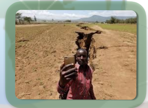
Image of what the fault line can cause.