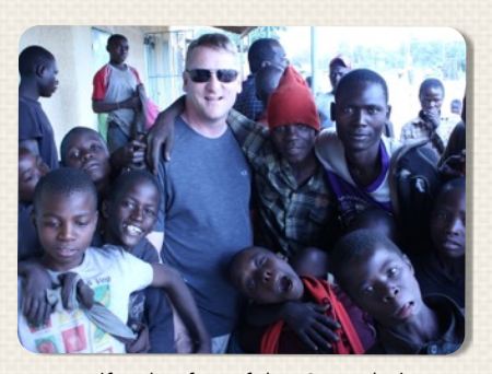
Myself with a few of the Street kids.