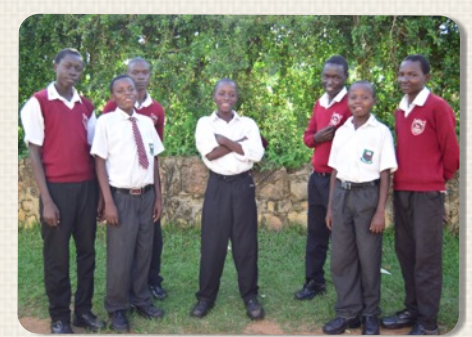
The boys off in High School

There are 34 children that your support is providing this home for. There is no support from local or national governments. You are also providing education by paying for these children to attend school since in Kenya a fee is required to send your children to school. In speaking with the children, we asked them what they would like to be when they grow up. Many said they would like to be a doctor, a surgeon, an engineer, or a journalist. These children know they have a future! If it was not for your financial support of this ministry they would be living on the streets!