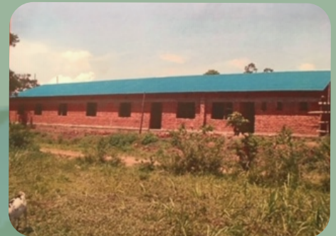
Construction of the Children's Home