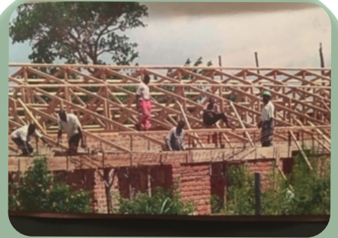
Construction of the Children's Home