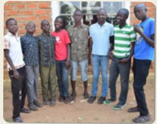
Our boys entering into High School.

It is rare that a child here in Kenya, even from a good home, will be able to attend high school to receive an education. Most children are raised up working for their families in