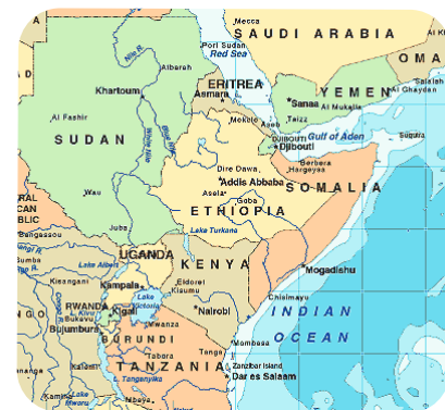
North East Africa

We have checked what we may need to store as to food and supplies to provide food and care for our orphans and ministry here in Bungoma. We are praying to have all the funds we need to create the store house immediately.