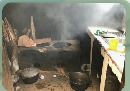
Kitchen Children's home - part of the restoration

Bungoma Bible Ministries ♦ PO BOX 25489 ♦ Colorado Springs ♦ Colorado ♦ 80936