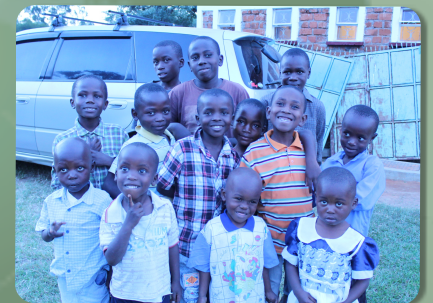
Vehicle that quit work...

We are called to have community with one another. Lifting one another up when the other is weak. We pray for you!