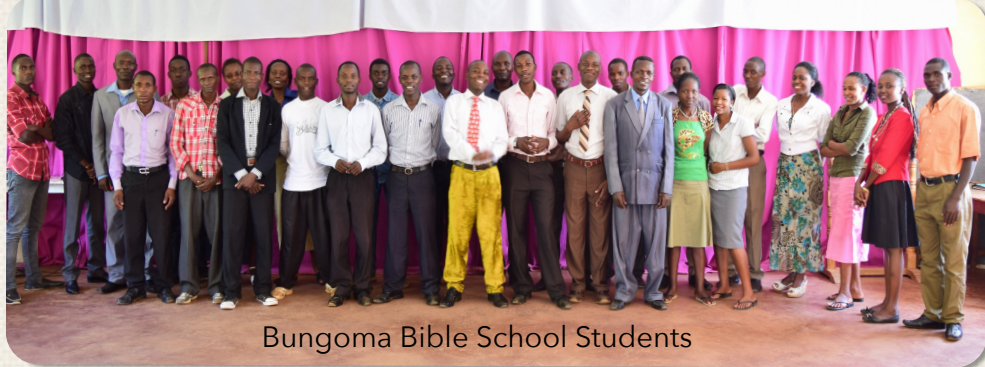
Bungoma Bible School Students