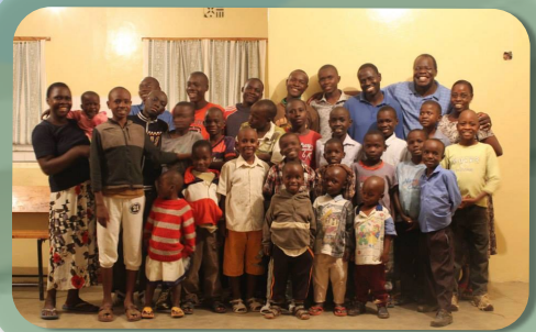
Boys from Bungoma Children's Home

Bungoma Bible Ministries ♦ PO BOX 25489 ♦ Colorado Springs ♦ Colorado ♦ 80936