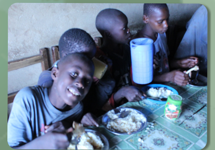
Ministry to the Street boys