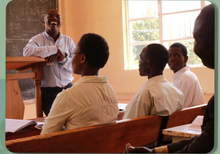
Class in Bungoma Bible School

Will you continue to bring Hope in 2018 to these little ones?