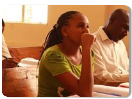
Bungoma Bible School Students