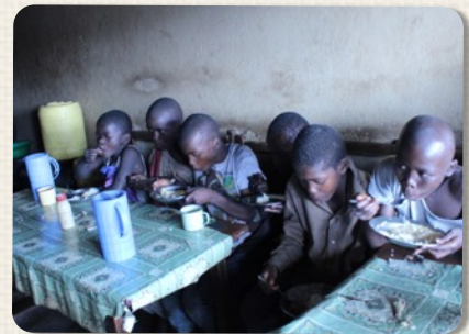
A few of the street boys eating the food provided them.