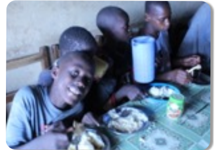
The street kids YOU reach out to feed