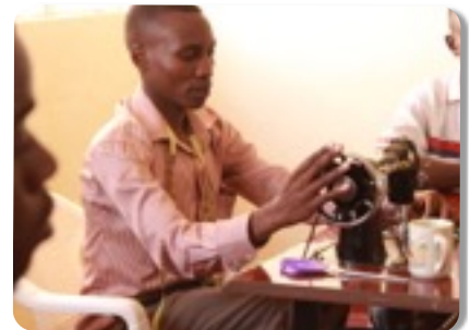
Your bible school students receiving practical training