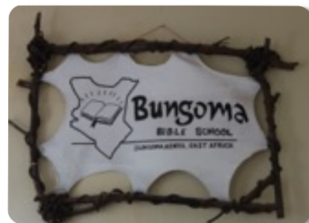
Sign for Bungoma Bible School