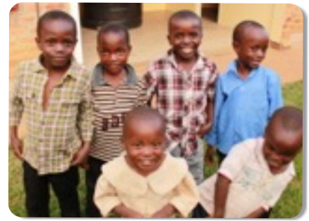
A few of YOUR happy kids from the children's home