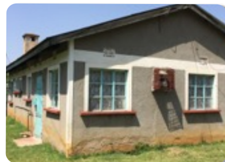
Our First home in 1988

It is because of YOUR monthly partnership that you have been able to see all these lives changed in Bungoma, Kenya.