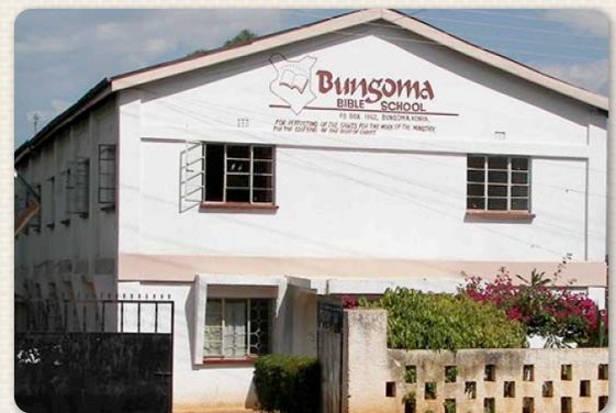
Bungoma Bible School Facility

Remember in the book of Ester when Hamon had a plot to kill all of the jews? It was Ester that was willing to sacrifice her life to save her own people. She went before the King to beg for her people's lives, knowing it could very well cost her own life.